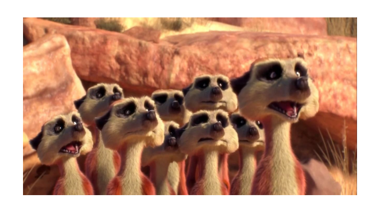
"Come down from there now!"