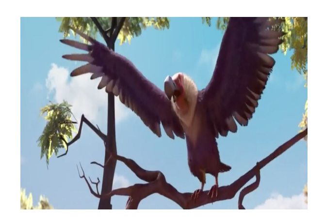
"Not likely!" the vulture replied sarcastically.