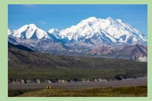
Mt McKinley, Alaska