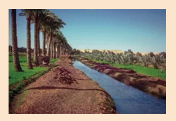
Egyptians have dug canals to transport water for farming

Because of this, over 95% of the people in Egypt live in towns and cities along the river as this is far easier than living in the desert.