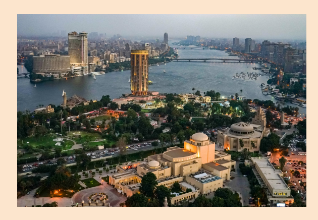
Cairo, the capital of Egypt is along the Nile