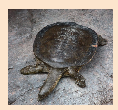
Soft shell turtles