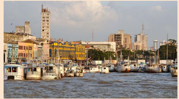
Belém is one city along the Amazon

These tribes are much rarer today however there are still several hundred recorded tribes who continue to live in the forest.